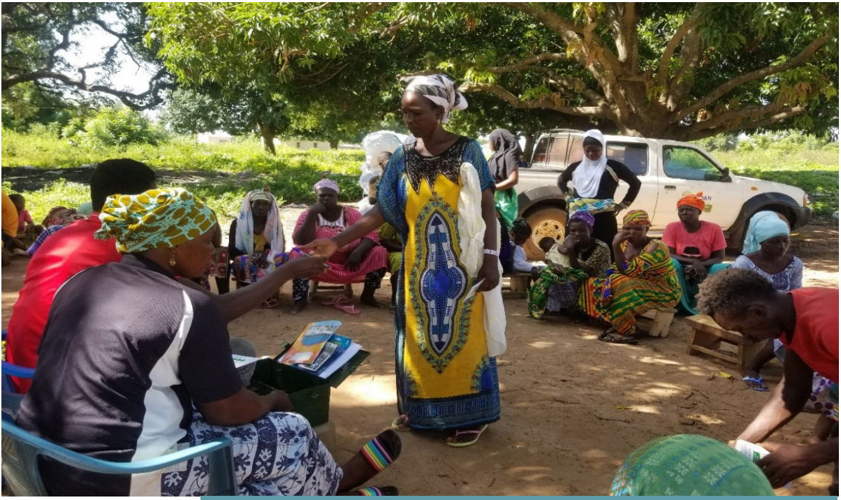
Financial literacy trainings have led to increased capacity

While access to finance is important, its management is critical to ensure pay back and avoid wasteful investment. The capacity of cluster actors must be built on lending, cash management, and investment. Broadly, financial literacy trainings are key in the financial inclusion agenda to ensure actors make informed financial decisions that will facilitate growth in their businesses.